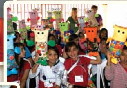
Buddy Pillows in Costa Rica