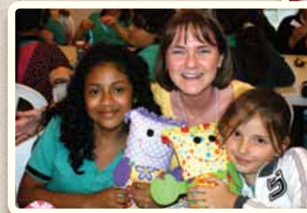
Friends in Costa Rica