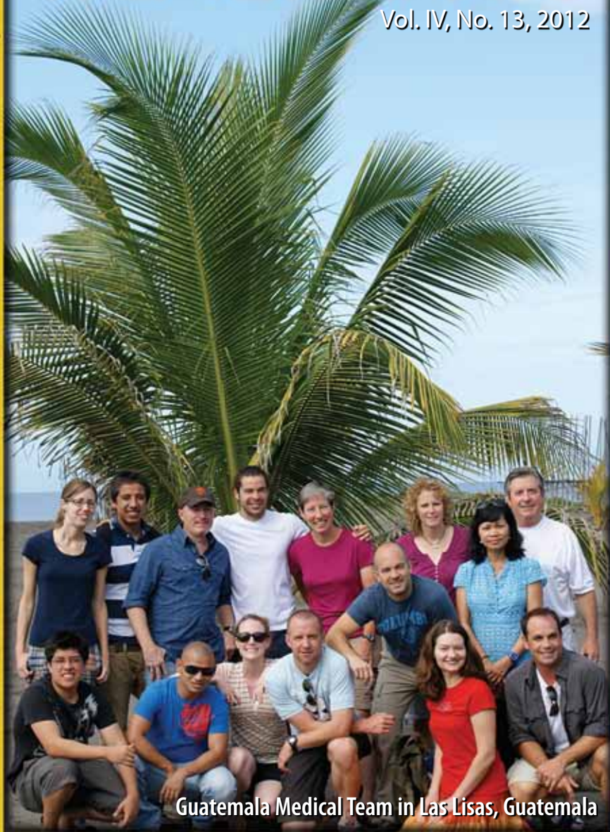
Guatemala Medical Team in Las Lisas, Guatemala