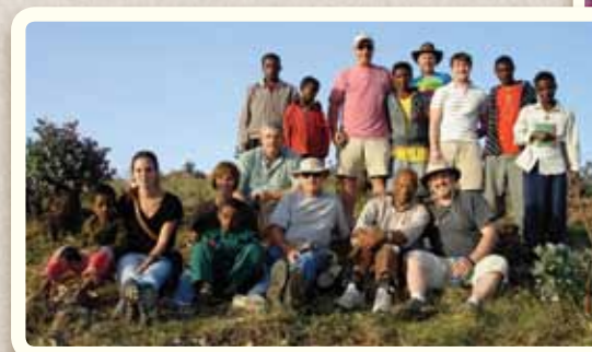
Ethiopian Day Hike