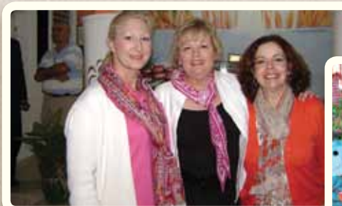
Brazil Women's Conference

Therefore go and make disciples of all nations, baptizing them in the name of the Father, Son and of the Holy Spirit, and teaching them to obey everything I have commanded you. And surely I will be with you always, to the very end of the age (Matthew 28:19 -20).