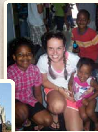
VBS in Bahamas